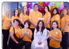
Aponia Dental Hosts Tooth Fairy Day 2012!

Aponia Dental is looking for talented people to join our team and help provide Edmonton with outstanding dental care.