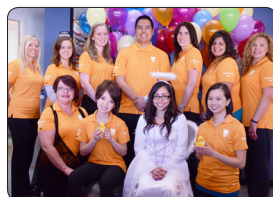
Aponia Dental Hosts Tooth Fairy Day 2012!

Whether you're a dental hygienist, a dental assistant or someone who has great client care skills and is interested in working with people in a front office position, we'd like to talk to you!